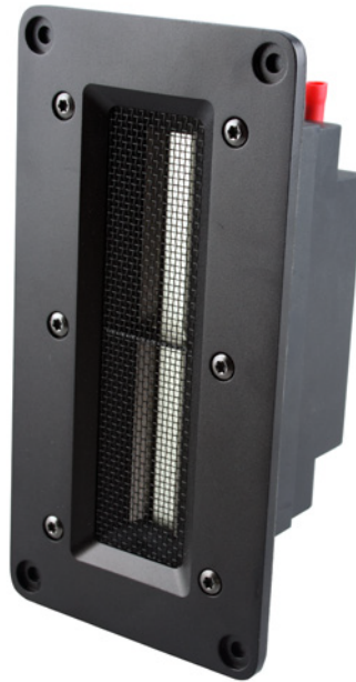
NeoCD2.0 True Ribbon Tweeter